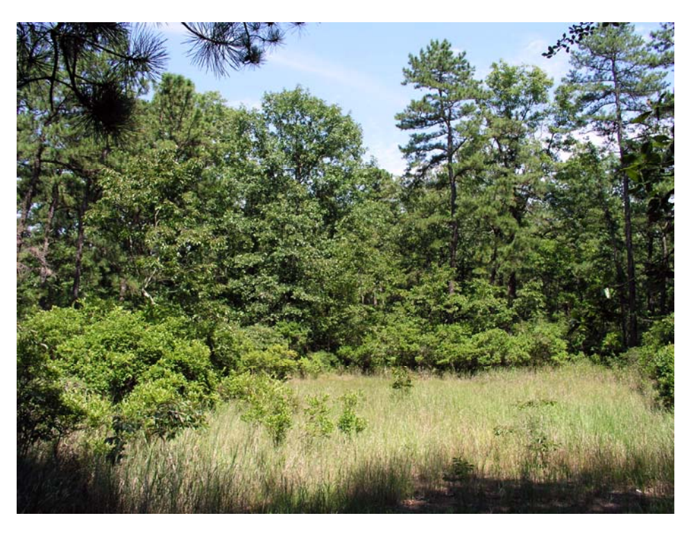
Above: The Cologne Avenue property is home to vernal ponds such as the one above.