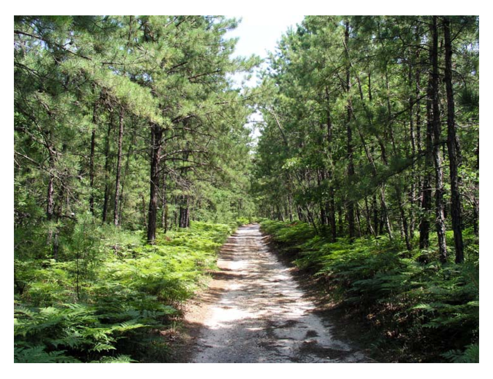
Above: Ferns line the sand road that meanders through the center of the Cologne Avenue property.